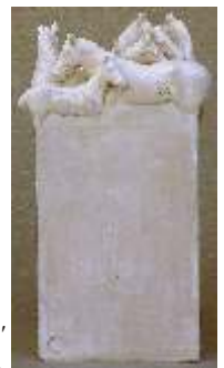
'Copyright Pillar' 33 x 19 cm.