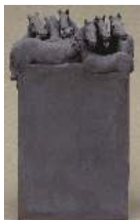
'Block Horse Sculpture' 28x 18 cm.