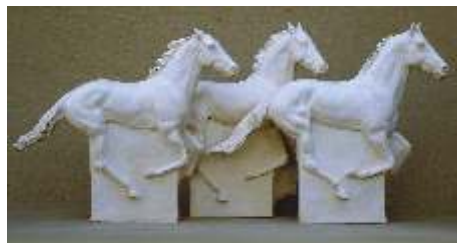
'Gallop Three' 36 x 65 cm.