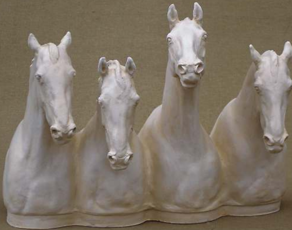
Above: 'Classic Four', 25x 35 cm. Below: 'Running Horses', 37x62cm.